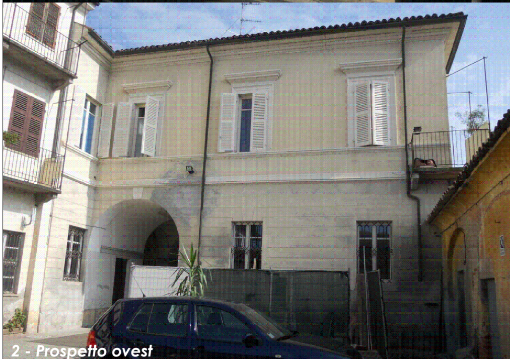
2 - Prospetto ovest