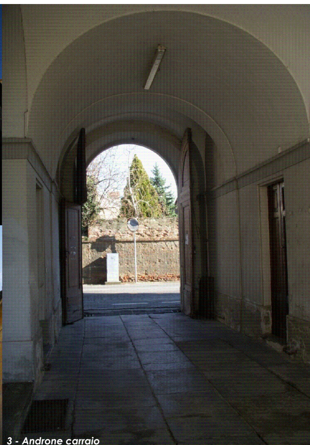
3 - Androne carraio