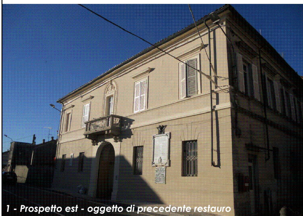
1 - Prospetto est - oggetto di precedente restauro