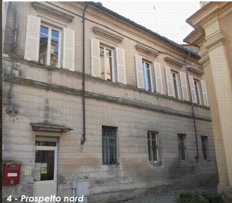
4 - Prospetto nord